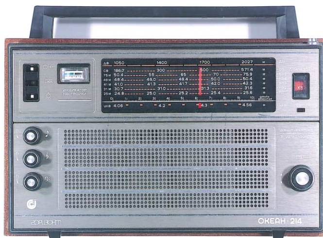
Figure 1. The radio that has been used in this study

To understand what this flaw is, I decided to follow the advice of my high school mathematics teacher, who recommended testing an approach by applying it to a problem that has a known solution. To abstract from peculiarities of biological experimental systems, I looked for a problem that would involve a reasonably complex but well understood system. Eventually, I thought of the old broken transistor radio that my wife brought